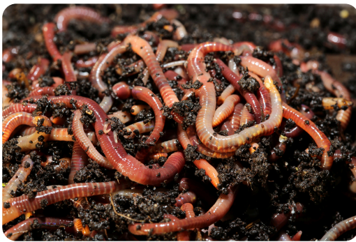
Commercial earthworm farming

Investing in earthworm farming makes sense—not only are you contributing to soil regeneration and waste reduction, but you're also tapping into a growing market for sustainable agriculture .